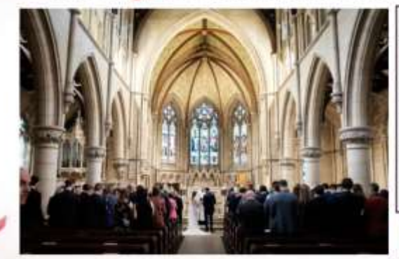
ST JOHN'S CHURCH RANMOOR, SHEFFIELD