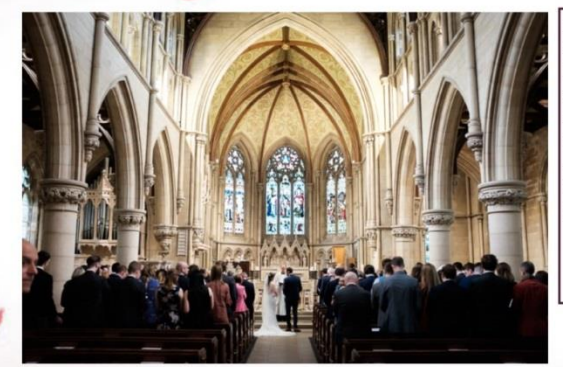
ST JOHN'S CHURCH RANMOOR, SHEFFIELD